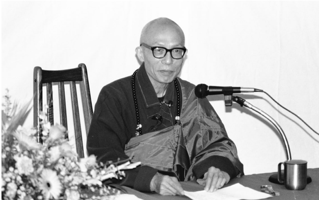
Master Sheng Yen in November 1992

from Taiwan told me, “It’s really strange, Shifu! I can’t read sutras. Whenever I read sutras in the morning, I end up fighting with my wife in that very afternoon.” I said, “This is not right. Reading sutras is supposed to enhance your compassion. How come you end up fighting with your wife?”