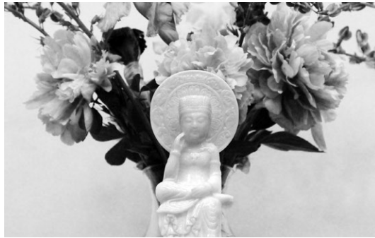
Maitreya Bodhisattva

But my main topic is persistence and determination; please don’t go back now to relaxing and being compassionate towards yourself, and forgetting the huatou. Don’t stop asking it with a strong determination. It’s a heroic act, to take up the huatou and work on it. Master Hanshan from the sixteenth century said that it is like going into battle with ten thousand enemies and you have the huatou as a sword. What are these ten thousand enemies? They are all other phenomena, all wandering thoughts and everything which interferes with our practice. But we take up this huatou courageously as if holding a vajra sword, a diamond sword in our hand