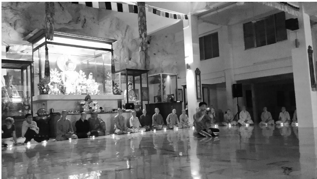
The Inexhaustible Lamp Ceremony

The last day of the retreat had an entirely different schedule – after the morning meditation we had a short repentance ceremony followed by (re)taking refuge in the three treasures and (re)taking the five precepts. This was the last activity we completed in noble silence, and then it was picture-taking time, clean-up and breakfast, and we could slowly return to our normal channels of communication. The most unusual schedule item, in my opinion, was what followed after breakfast – we returned to the Chan Hall, divided into groups based on our work meditation assignments, and brought up anything and everything that came to mind that could be improved on the temple grounds or in the retreat process. Every group wrote down a number of suggestions from things that actually needed fixing, like leaking pipes or broken door handles, to things of no consequence whatsoever, like spider webs in the corners and how the handles of the brooms needed