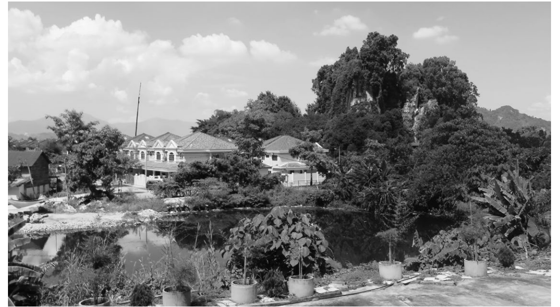
Panna Cave Temple

Truthfully, my overall experience was not as pleasant as I was hoping for – it could be best described as about equal amounts of struggle and sense of purpose. Part of the reason why I wanted to join a longer series of retreats was because in the past I came out of most retreats thinking, I wish I could have continued for longer. The usual rhythm of unfolding for me was: adjusting to the environment for a day or two, facing some previously suppressed emotional issues and crying it out for a day or two, then the positive feelings would take over more and more, so I feel very joyful and energetic by the time we go home.