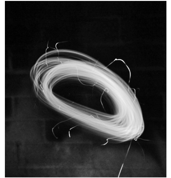
The Ring of Fire

What is worse, we take the words “I” and “you” as the real persons, “me” and “you.” Operating like this, prior and later thoughts arise incessantly, one after another without stopping. We constantly take phenomena as self, taking the dualistic mind that