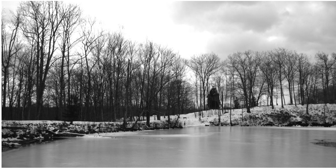
Frozen Lake at DDRC

retreat, it was rather unimportant whether one was familiar or skillful with the meditation methods. Instead, the most important point was to rethink the meaning of becoming a monastic, and to mull over the attitude and focus we should uphold in our practice. Through such exercises, we reinvigorated our minds, which may have become fatigued over time. In this sense, this was truly a “monastic winter retreat,” where the mind that has slowly drifted into “hibernation” is now re-awakened due to its proximity to the original source of heat.