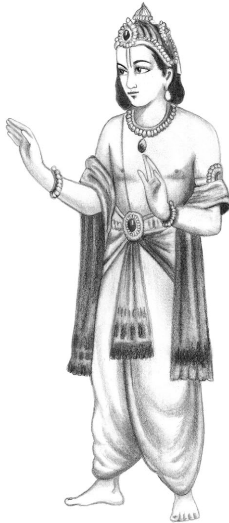
The Hungry Demon Rakshasa and the God Indra

lives the Buddha was a young ascetic practicing austerities somewhere in the region of the Himalaya. The God Indra saw him practicing really hard and decided to test him, so he turned himself into a hungry Rakshasa demon and appeared in front of the young practitioner. He decided to tell him half of a very important Dharma teaching contained in one sentence, but not tell him the other half. The rakshasa said “Everything is constantly arising and perishing; this is the law of birth and death.”