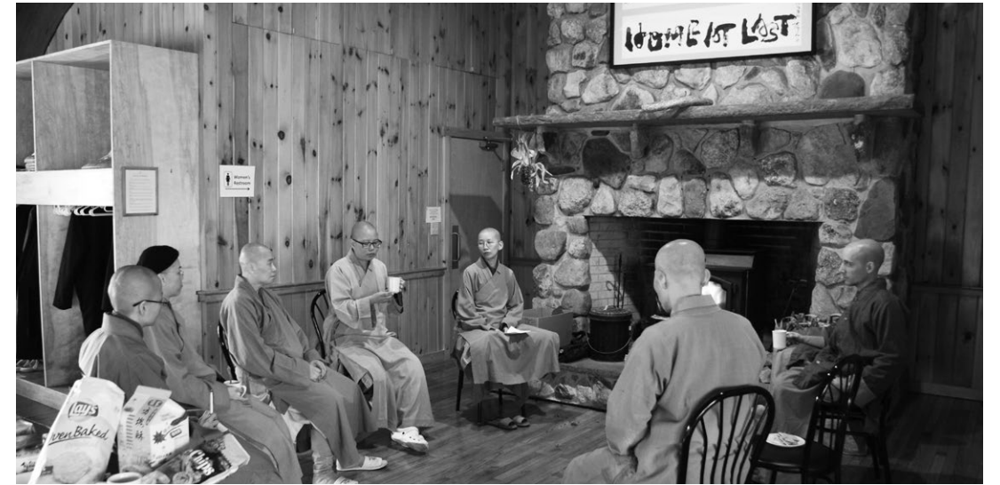
Sharing experiences after the retreat

schedule, and listened to talks Shifu gave during a monastic retreat in 1998. The final three days consisted of sharings and outdoor meditations. It provided a window of opportunity for the usually widely dispersed Dharma brothers and sisters to bond and build camaraderie.